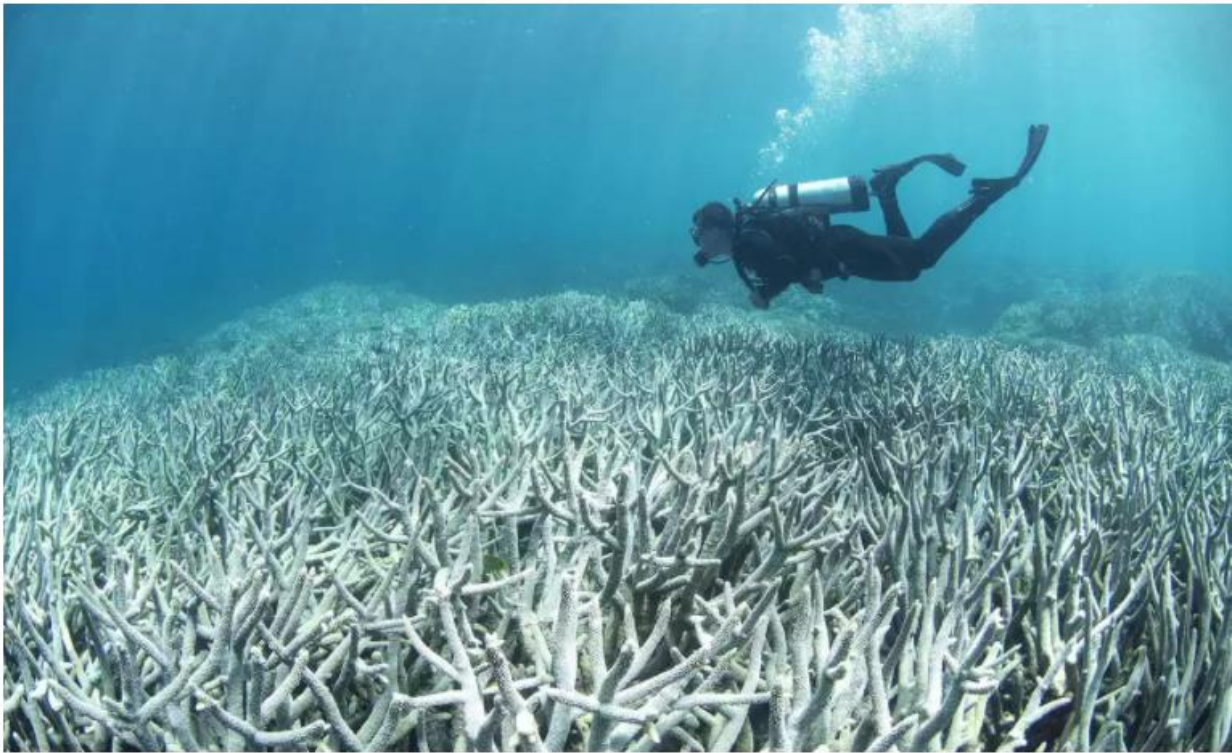
▲ A diver checking bleached coral on the Great Barrier Reef – around half has now been bleached.

The death of the Great Barrier Reef is one of the “great tragedies of our lives” US senator John McCain has said, arguing America should uphold its commitment to the Paris climate agreement , or accede to it with minor modifications